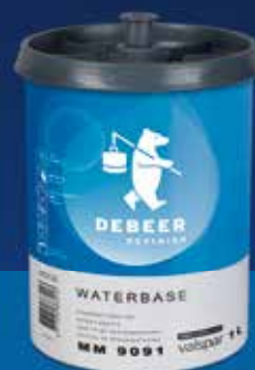
WaterBase 900+ Series